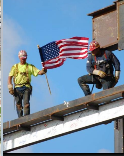
Mile High Stadium